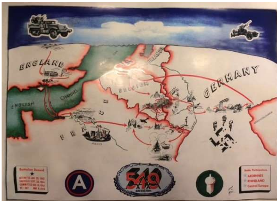
This battle map was drawn by a member of the 549th and is on display at the St. Charles County Veterans Museum